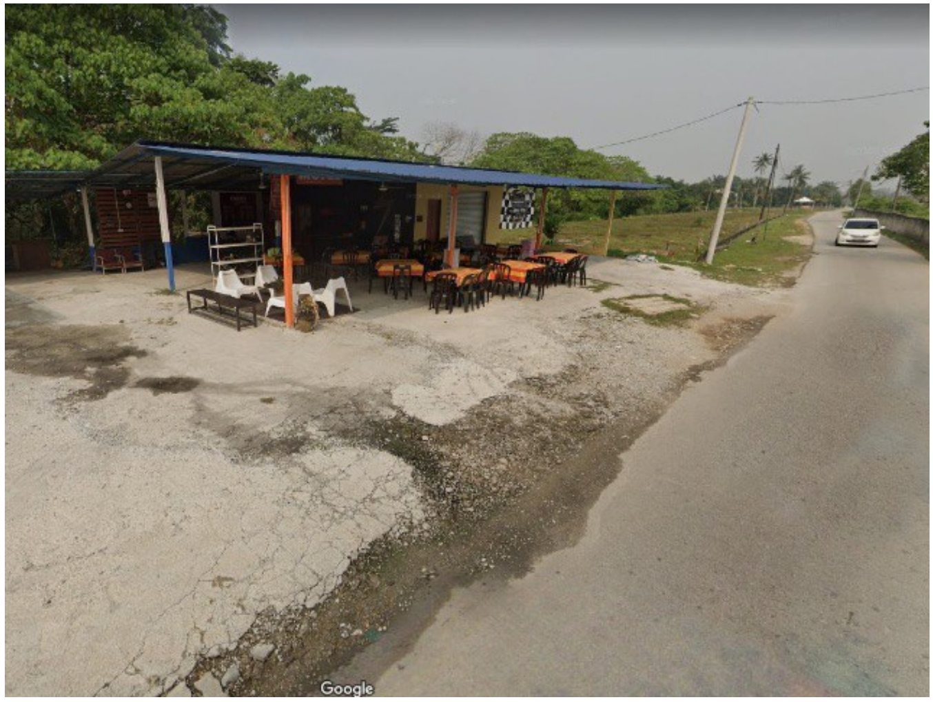
Page 4 of 4